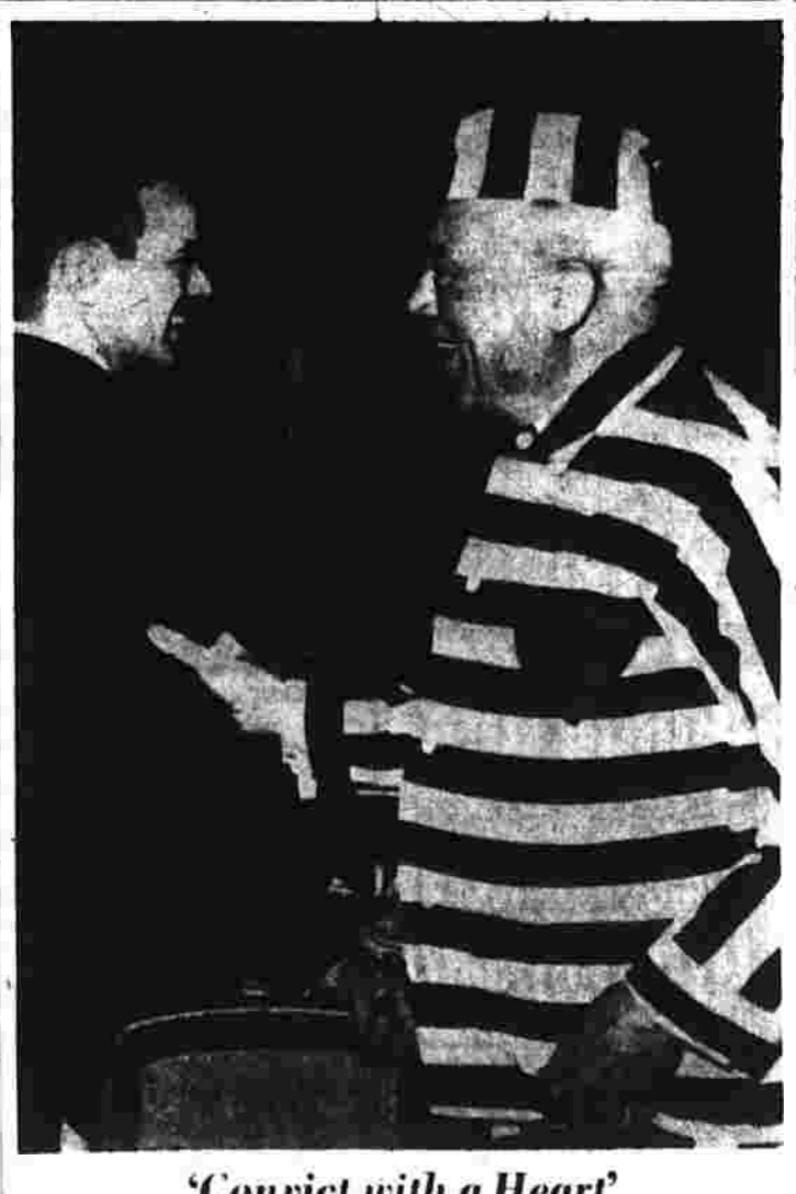
'Convict with a Heart' All in fun, Supreme Court Justice Raymond K. Baldwin was arrested in a prankster's act as he was taken to jail for a 30-day term in the Supreme Court building in New York City. Baldwin was arrested by a group of pranksters who staged a mock arrest of the justice. Baldwin was released after 30 days.

The State Department said today that the United States will continue to support its ally's arms program.